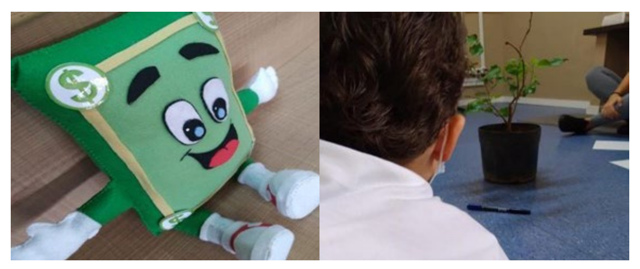
Figure 5. Images collected in Workshop 2