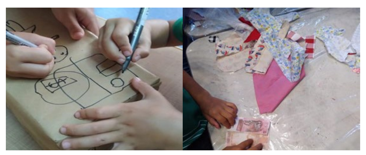
Figure 7. Images collected in Workshop 3

At this point, the children realized that the money they currently have is on account of their parents and know that they will have to work in the future; again, they were very receptive to the activity and became involved in each proposed task. The children also became excited with the idea of being able to retire someday, realizing that they needed to work before retiring.