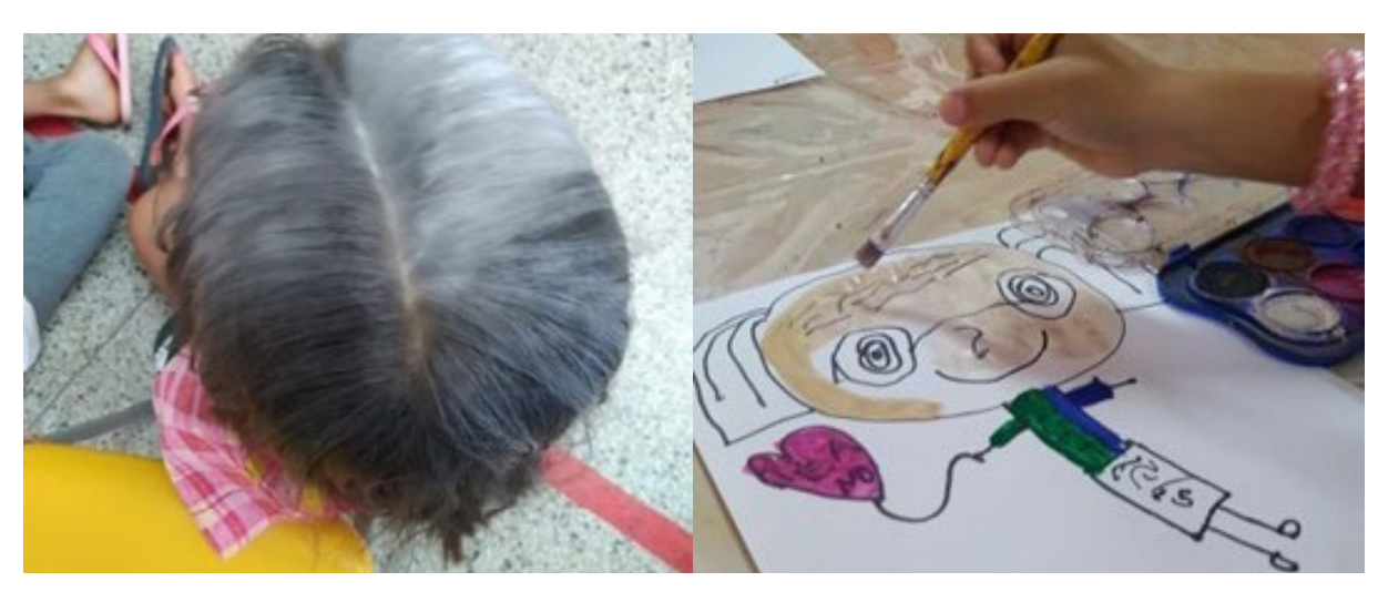
Figure 8. Images collected in Workshop 4

We initiated the fourth workshop by reviewing the teachings and concepts learned in the previous three workshops: "what did we talk about in the previous meetings? What did we talk about?" Next, the children were asked, "What do you have to do to retire?" One of the children answered, "we have to get old," and another mentioned, "work for many, many years." Then, to make the moment more believable, the children were "transformed" into elderly individuals using baby powder and scarves made of chita fabric (Figure 8).