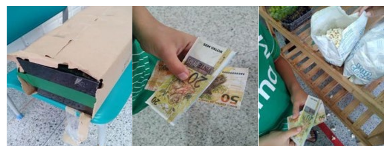
Figure 9. Imagens colhidas na Oficina 4